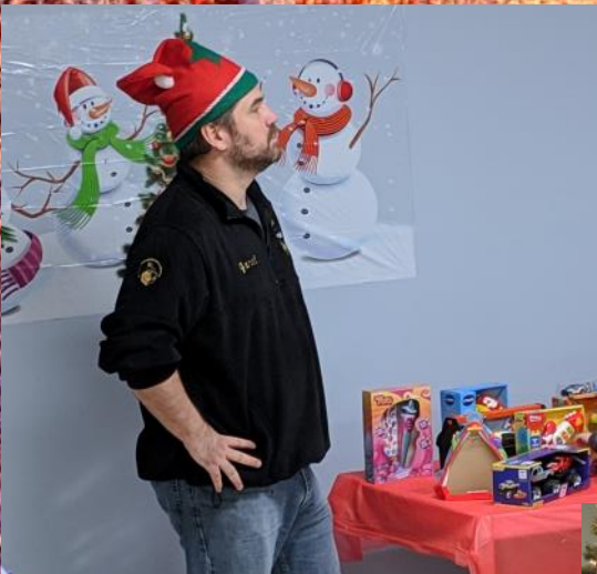
Illustrious Sir pondering his choices in life