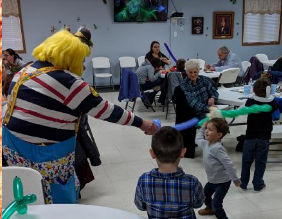
The clown is going down